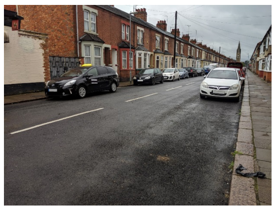
Southampton Road 2.30pm on a weekday in June

4.7.4 The local Highway Authority have carried out an exercise on the relationship between the concentration of HMOs and parking problems. The purpose of the exercise was to ascertain whether the problems with limited capacity of on-street parking are associated with the concentration of HMOs as a part of a consultation response to an HMO application.