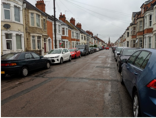
Holly Road 6.30pm on a weekday in June