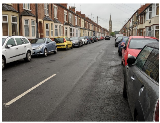
Southampton Road 6.30pm on a weekday in June