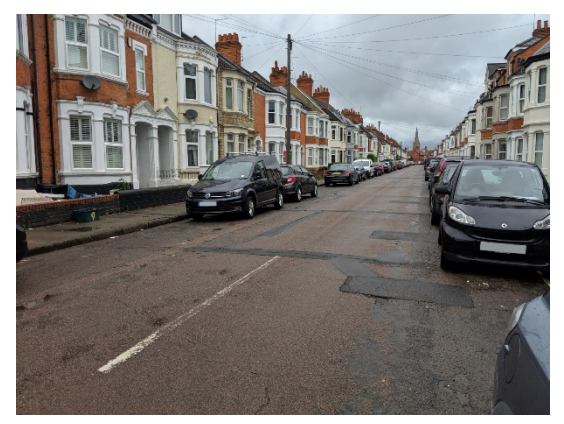
Holly Road 2.30pm on a weekday in June